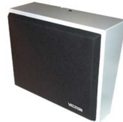
V-1052C Amplified Wall Mount Speaker Gray w/Black Grille

The interior wall speaker, the V-1052C, is a 8" Speaker/Amplifier Assembly capable of reproducing paging as well as back ground music. This speaker has an externally accessible volume control located behind the grille and is screwdriver adjustable. The enclosures are made of steel with a durable powder coated finish. The color of the enclosures can easily be changed to match any decor. A cloth covered detachable grille is included. The speaker requires -24VDC, 50mA (1 power unit).